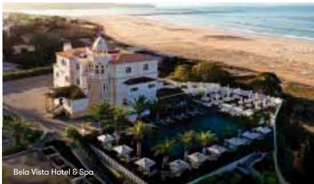
Bela Vista Hotel & Spa

Located in an elevated position overlooking Funchal, the elegant Quinta Jardins do Lago has been wonderfully transformed into a luxury property whilst retaining the character and beauty of the original 18th century manor house. Whether you stay in the original building, or the new wing, you will find all rooms are furnished to a high standard with southern views overlooking the exquisite gardens.