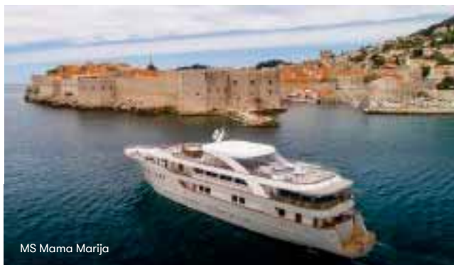
MS Mama Marija