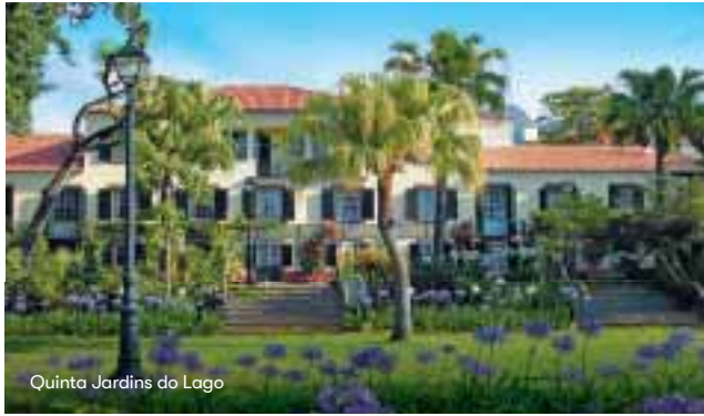
Quinta Jardins do Lago