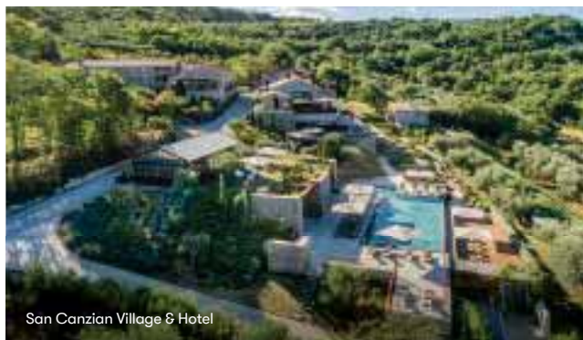
San Canzian Village & Hotel