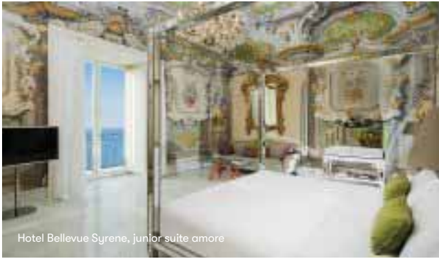
Hotel Bellevue Syrene, junior suite amore