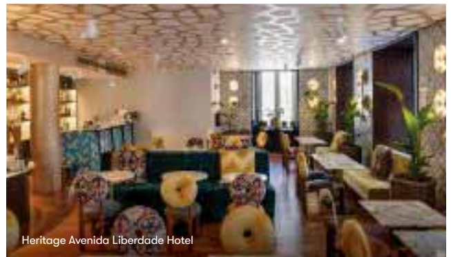
Heritage Avenida Liberdade Hotel

In a prime location on the banks of the River Douro in Pinhao, in the heart of a region renowned for its extraordinary quality wines, The Vintage House is a former 18th century wine estate that has been carefully restored retaining its traditional architecture whilst offering the comfort of modern facilities and a high level of service. With a backdrop of vineyard covered mountains and furnished balconies overlooking the waterfront, classically elegant guest rooms and suites are well-appointed and spacious.