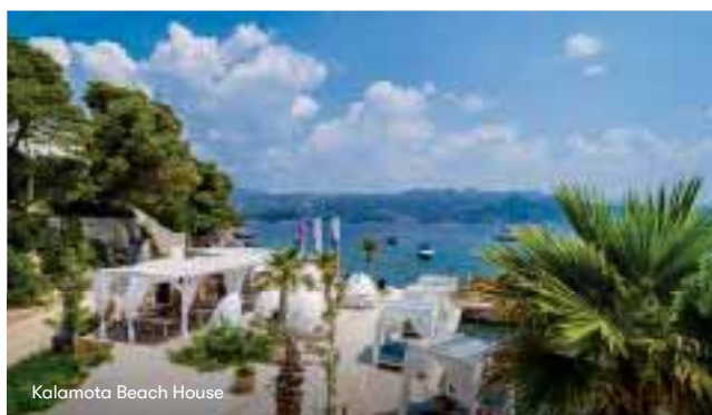
Kalamota Beach House

In an exceptional setting on a hillside in a medieval hamlet and a five-minute drive from the town of Buje, San Canzian Village & Hotel is a truly beautiful rural retreat in the heart of the Istrian countryside. It is ideal for couples in search of peace and quiet, highly personal service and an outstanding gastronomic experience. Surrounded by vineyards and olive groves it has the feel of a small village with a collection of typical Istrian style buildings housing guest rooms and suites. A member of Small Luxury Hotels of the World.