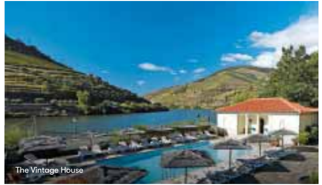
The Vintage House