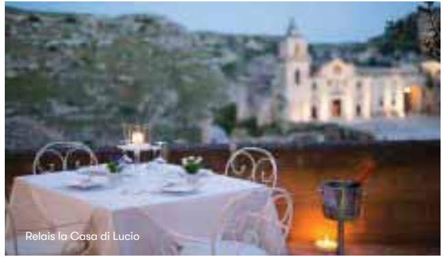
Relais la Casa di Lucio