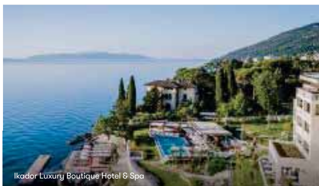
Ikador Luxury Boutique Hotel & Spa

Discover the beauty of the Dalmatian Coast with our island hopping cruises on smaller ships. Our deluxe motor cruisers carry no more than 40 passengers for a more exclusive and intimate cruising experience. Enjoy access to the more secluded coastal areas, narrow waterways and smaller ports that larger vessels cannot reach. As well as offering conspicuously good value for money, you'll be able to combine time spent on board with exploration of some of the more remote areas of Croatia.